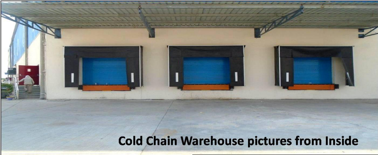
Cold Chain Warehouse pictures from Inside