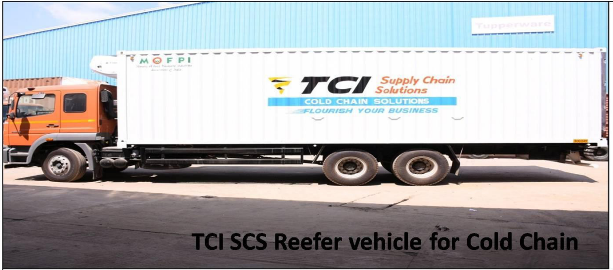
TCI SCS Reefer vehicle for Cold Chain